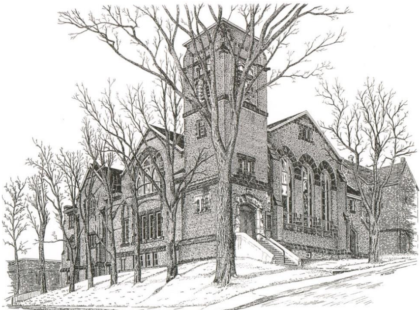
FIRST PRESBYTERIAN CHURCH, NEW GLASGOW, N.S. — EST. 1786

902-752-5691 first.church@ns.aliantzinc.ca