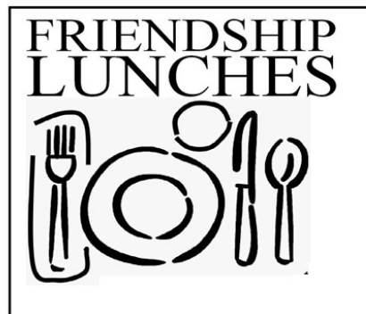
NCSA Friendship Lunch Sunday March 17th