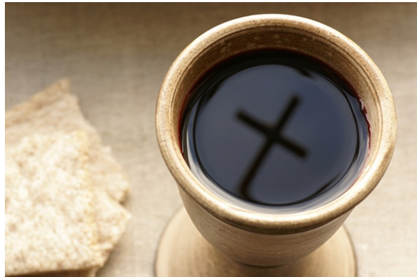
Holy Communion Sunday March 10th

Sun. March 10th @ 3pm ■ Friendship Lunch Sun. March 17th with St. Patty's day fun!