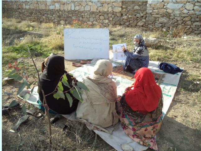
Midwives in Afghanistan lead COVID-19 awareness trainings with community members.