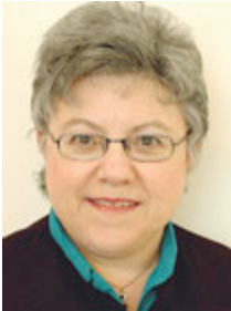
Beverley Y. Shepansky Central, Vancouver