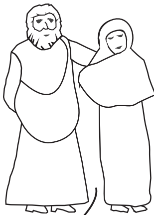
Luke 2:41 - 52