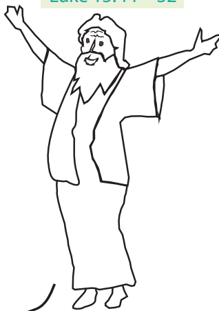
Luke 15:11 - 32