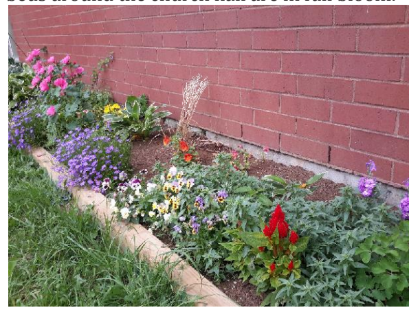
*** Sept 02 - Sept 8 *** Sun 11:00am Worship

Garden . In case you haven't been around through the summer, the revitalized flower beds around the church hall are in full bloom.