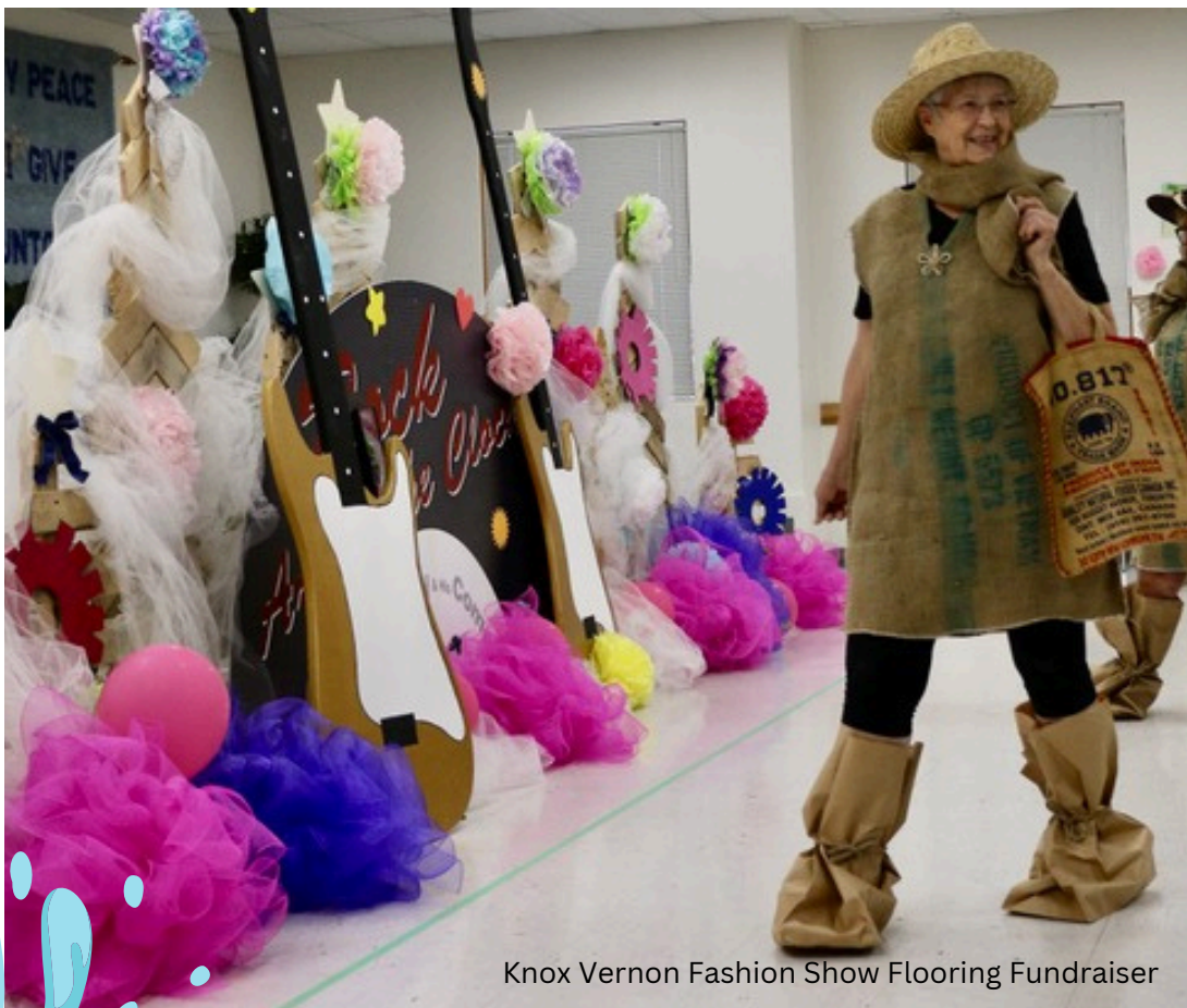
Knox Vernon Fashion Show Flooring Fundraiser