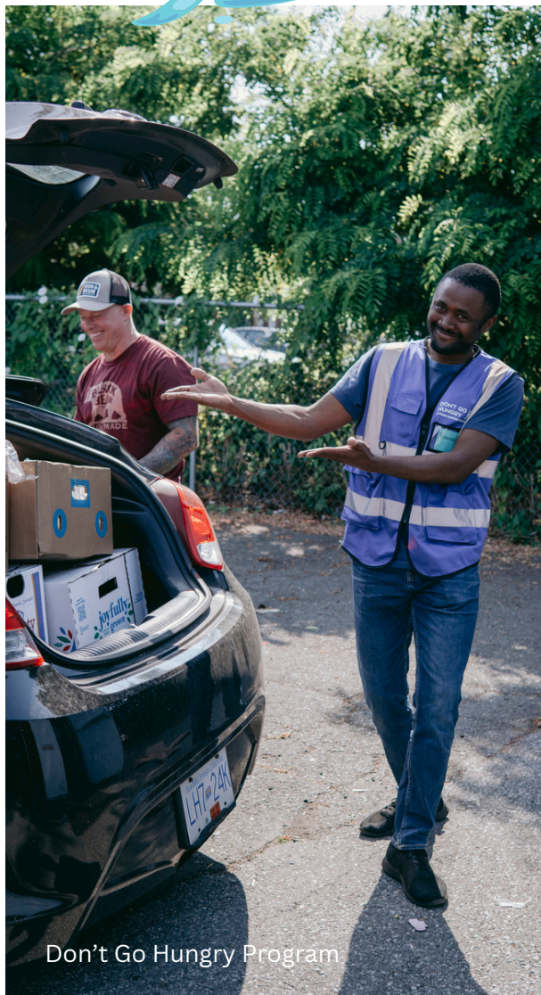
Don't Go Hungry Program