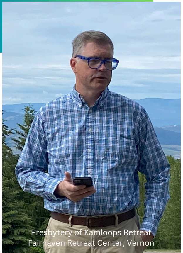
Presbytery of Kamloops Retreat Fairhaven Retreat Center, Vernon

Presbytery of Westminster Incoming Moderator