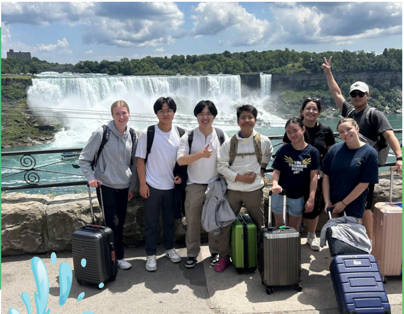
Uplift 2024 Youth Event

The final day of the annual Synod gathering was a coming together of the congregation of Calvin Presbyterian Church and the remaining commissioners. Communion was served. At the benediction of the service, the Synod for 2023 was declared finished. Commissioners returned home at their leisure throughout the afternoon.