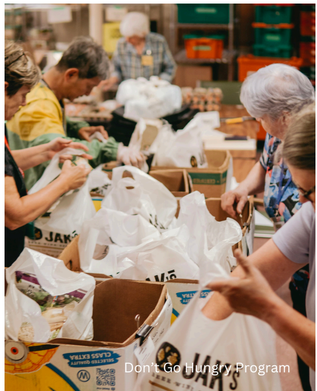
Don't Go Hungry Program

For those who would rather stay put, the church will remain open. Curl up with a good book, a mad game of scrabble or tinkling the ivories with your favourite hymns.