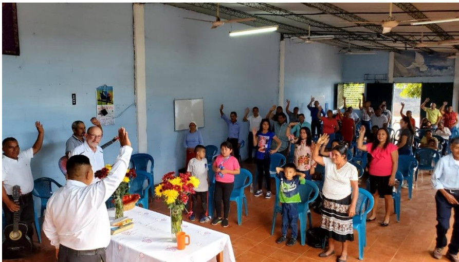
Compassionate God Baptist Church, Ahuachapan, El

Do I wish I had never had such a journey? I do not. In the faces of the poor, I see the image of the Christ. In the children of the poor, I see hope for tomorrow