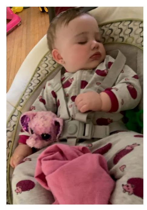
Blake After Playgroup Zzzzzz