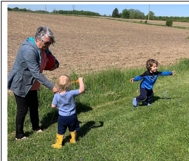
Blowing bubbles and catching them!