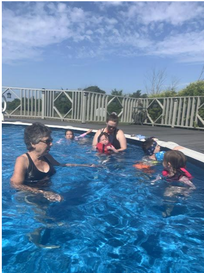
July Pool Party

All preschool children and their caregiver are welcome to join us.