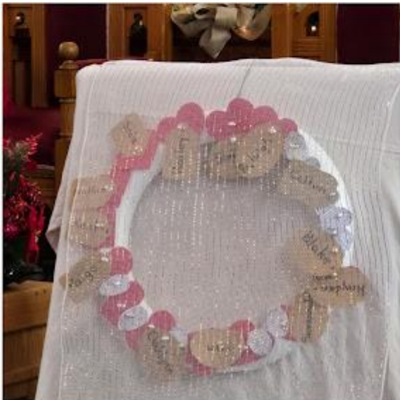
The completed snowflake made up of hearts, fingerprints, and names. Intricate and unique.