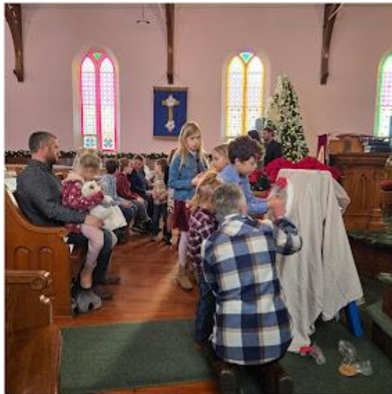
The children in action pinning the heart on the snowflake wreath.