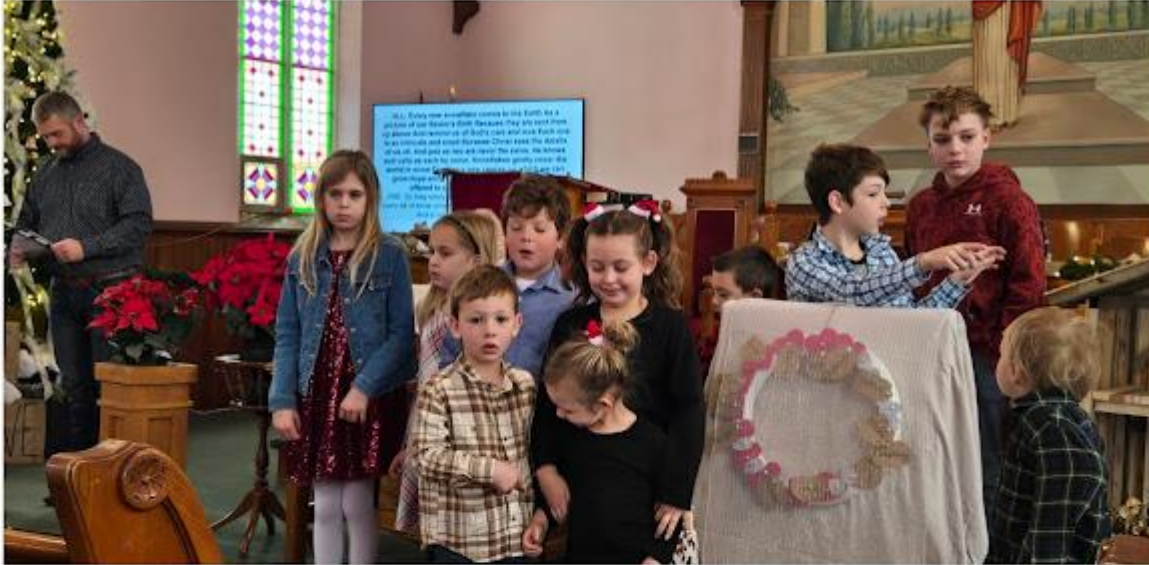
A shot of most of the children with the completed snowflake

While we were setting up, we played Snowflake Dance to get everyone thinking “snowflakes”. Six families read a narrative while the children pinned a heart, fingerprint, and their name on a wreath. Carols were sung throughout. By the end of the narrative, the children had created a snowflake reminding us of what we really celebrate at Christmas—the birth of a tiny baby who changed the world, just like the snow changes our world today.