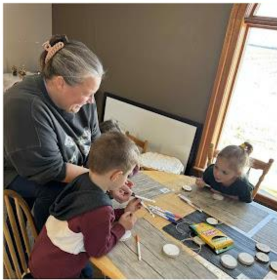
December Playgroup with our guest reader and the children making a snowman Christmas tree decoration.