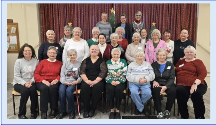
The Craft & Chat Gals and Friends Christmas 2025