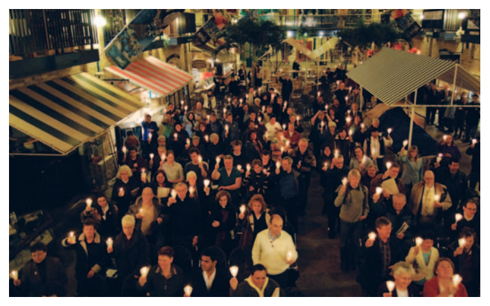
Gathering for reconciliation at the Forks in Winnipeg,