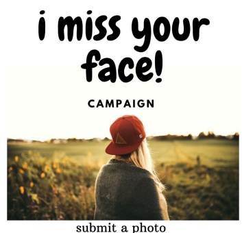
tell us something you've been up to! collages will be on our website

We all miss seeing each other! Consider snapping a pic and tell us something you've been up to! Send it to Rev. Shelly at rev.kocis@caradocpresbyterian.ca and she will post each week a collage of pictures.