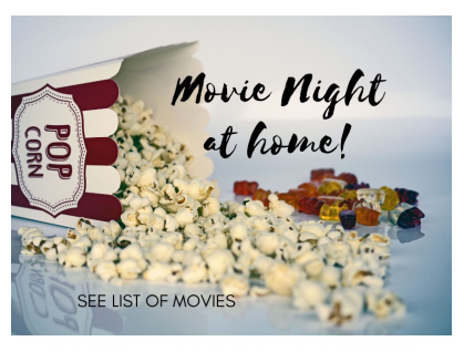
PICK 1 NIGHT A WEEK make it a special night | make it your take out night too!

Disney Plus - Netflix - Pureflix (Go to our Keeping Busy page for links to sign up for these streaming services)