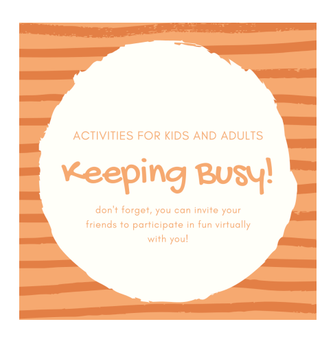
Go to Keeping busy!