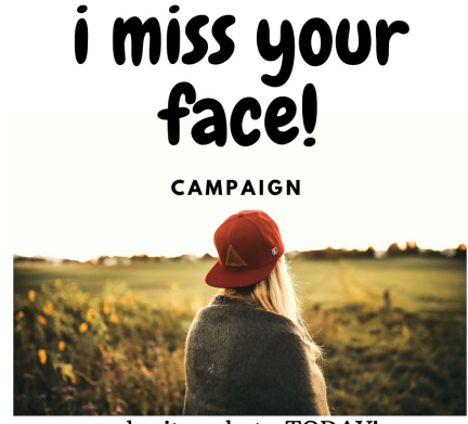
submit a photo TODAY! Don't be shy:) See picture collage on our website

click pic to go to "I miss Your Face" webpage