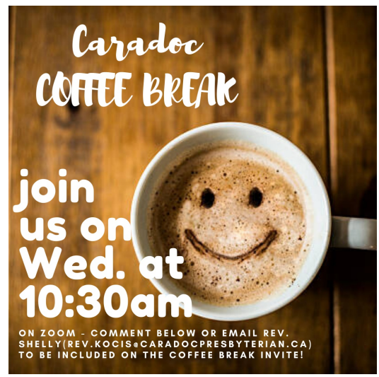
More info? click pic to go to "Coffee Break" webpage