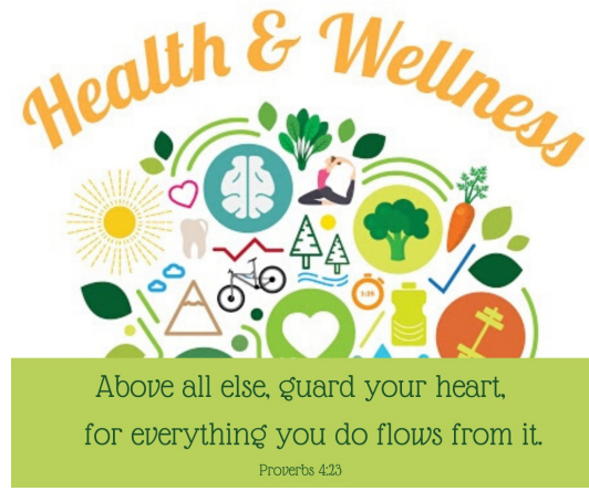
Health and Wellness