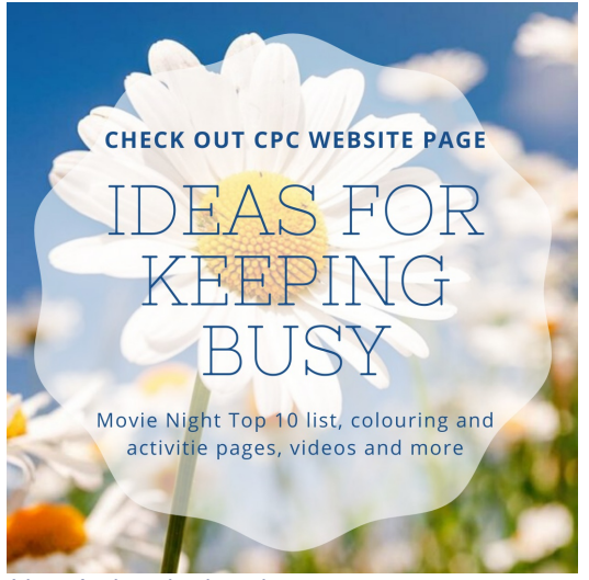
Ideas for keeping busy!