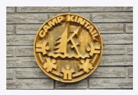
Click the pic to go to Camp Kintail website!

and join us for dinner, music and activities! RSVP by Wednesday July 15th.