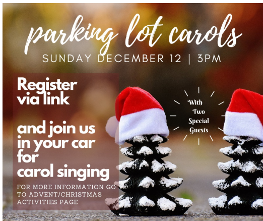
Parking lot Carols!