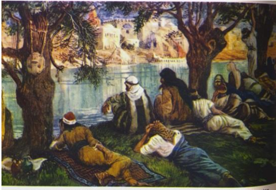
"By the rivers of Babylon, there we sat down, yea, we upon the willows in the midst thereof. How shall we sum wept, when we remembered Zion. We hanged our harps the Lord's song in a strange land? Psalm 137:1,24

These people were in deep despair and in need of words of comfort and assurance.