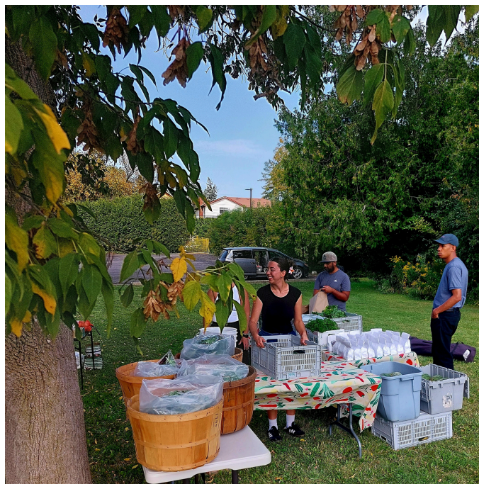
York Region's Affordable Fresh Food Market opens at St. James twice a month, year-round.

Every Friday night, a small team from St. James goes to COBS, picks up the leftovers and returns to the church Library to bag them. Then, on Saturday morning, a few people gather at St. James to help distribute the bread to other Stouffville organizations.