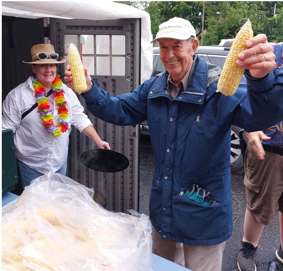
St. James' inaugural Corn Boil, held on August 28, drew a large crowd of members and community members into Morris Hall. Funds raised were donated to several community charities by the Outreach Team.