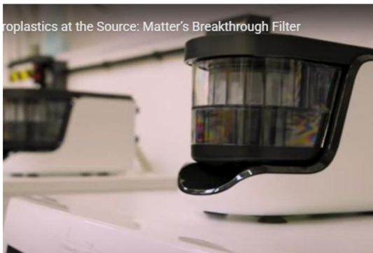
Microplastics at the Source: Matter's Breakthrough Filter

Based in Bristol, a city known for green innovation, Matter has developed Regen.®, a breakthrough filtration technology designed to capture microplastics at the point of release.